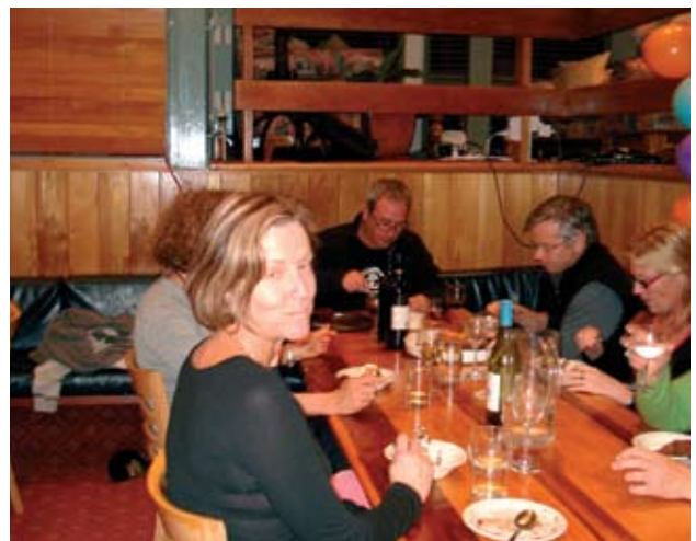
Queen's Birthday Weekend was great for the social activities.

Your Committee is seeking your feedback what you want from the Club. The Survey can be accessed from http://www.surveymonkey.com/s.aspx?sm=RodZsOqeAWVxfmboHbXb3Q_3d_3d or more easily through the link on www.aacfallscreek.com